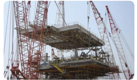
Sonamet heavy lifting activity