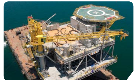
Mafumeira Topside in Lobito yard