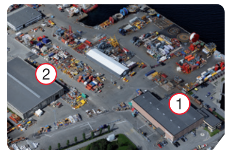
Dusavik Base Overview 1 - Warehouse/Workshop 2 - Warehouse