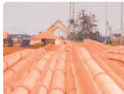
Stalk rack, Luanda