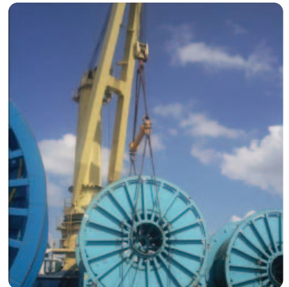
Reels lifted onboard