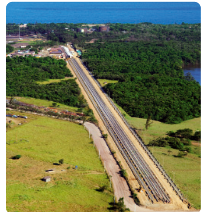
Ubu spoolbase, Brazil