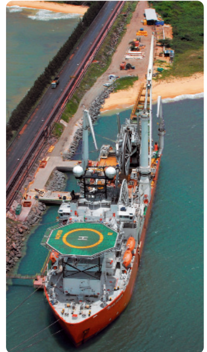
Seven Oceans at Ubu spoolbase, Brazil

The Seven Oceans pipelay vessel will carry out the installation of flowlines and will be supported by the Seisranger for survey and light construction work.