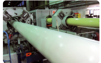
Flowline fabrication at Vigra, Norway